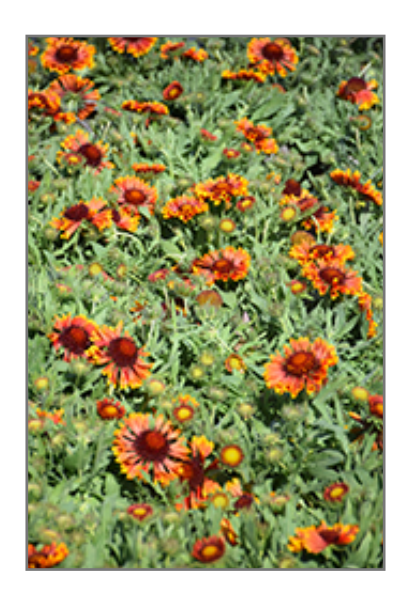
SpinTop Copper Sun Blanket Flower in bloom