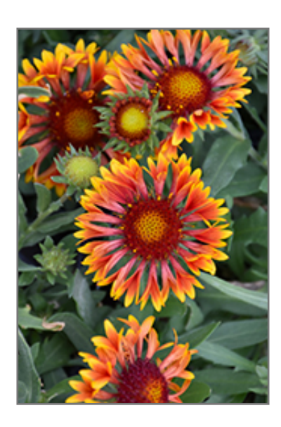
SpinTop Copper Sun Blanket Flower flowers

This plant will require occasional maintenance and upkeep. Trim off the flower heads after they fade and die to encourage more blooms late into the season. It is a good choice for attracting bees and butterflies to your yard, but is not particularly attractive to deer who tend to leave it alone in favor of tastier treats. It has no significant negative characteristics.