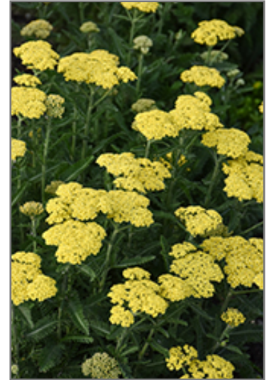
Firefly Sunshine Yarrow flowers

Firefly Sunshine Yarrow is a fine choice for the garden, but it is also a good selection for planting in outdoor pots and containers. With its upright habit of growth, it is best suited for use as a 'thriller' in the 'spiller-thriller-filler' container combination; plant it near the center of the pot, surrounded by smaller plants and those that spill over the edges. It is even sizeable enough that it can be grown alone in a suitable container. Note that when growing plants in outdoor containers and baskets, they may require more frequent waterings than they would in the yard or garden. Be aware that in our climate, most plants cannot be expected to survive the winter if left in containers outdoors, and this plant is no exception. Contact our experts for more information on how to protect it over the winter months.