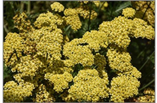
Firefly Sunshine Yarrow flowers

Firefly Sunshine Yarrow is an herbaceous perennial with an upright spreading habit of growth. Its relatively fine texture sets it apart from other garden plants with less refined foliage.