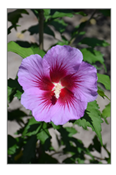
Purple Pillar Rose of Sharon flowers