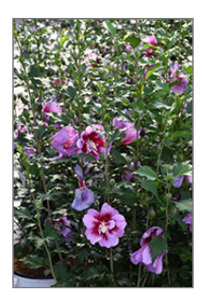
Purple Pillar Rose of Sharon flowers