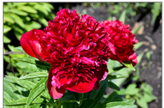
Red Charm Peony flowers