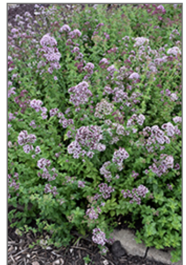
Oregano flowers