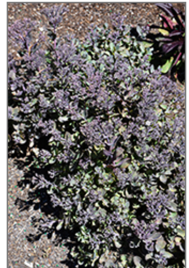
Dynomite Stonecrop in bloom