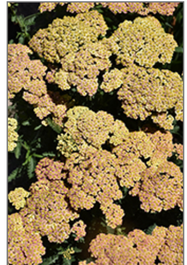
Firefly Peach Sky Yarrow flowers