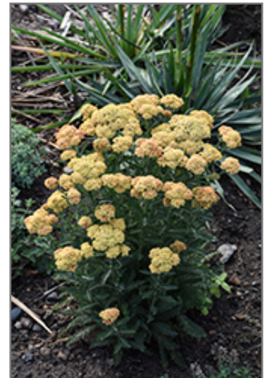
Firefly Peach Sky Yarrow in bloom