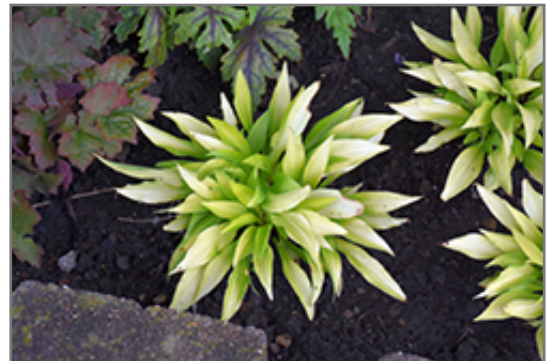
Munchkin Fire Hosta