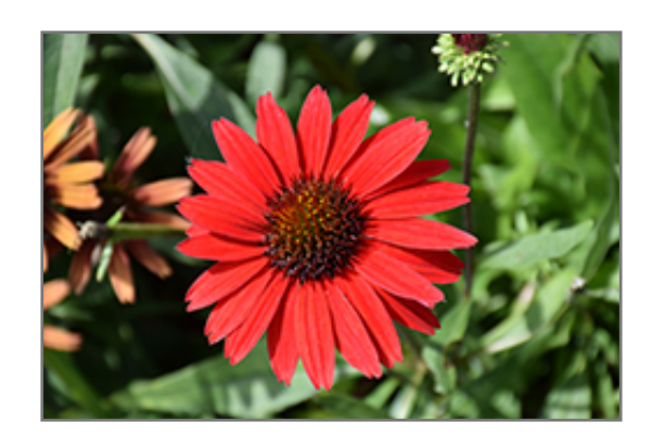
Kismet Red Coneflower flowers

This is a relatively low maintenance plant, and is best cleaned up in early spring before it resumes active growth for the season. It is a good choice for attracting butterflies and hummingbirds to your yard, but is not particularly attractive to deer who tend to leave it alone in favor of tastier treats. It has no significant negative characteristics.