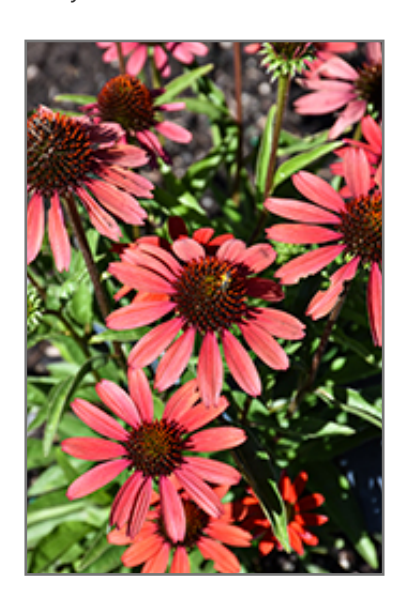
Kismet Red Coneflower flowers