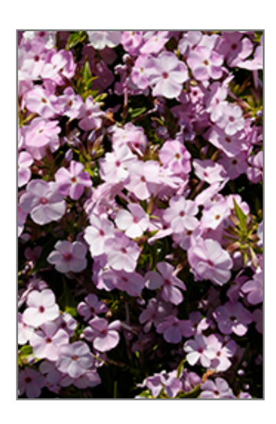
Opening Act Blush Phlox flowers

An early blooming phlox with a naturally dwarf habit; lavender-pink blushed flowers with deeper pink eyes; blooms profusely in early to mid-summer; great for borders or in containers; dark green glossy foliage is mildew and disease resistant