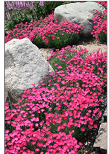
Paint The Town Magenta Pinks in bloom

Paint The Town Magenta Pinks is an herbaceous evergreen perennial with a mounded form. It brings an extremely fine and delicate texture to the garden composition and should be used to full effect.