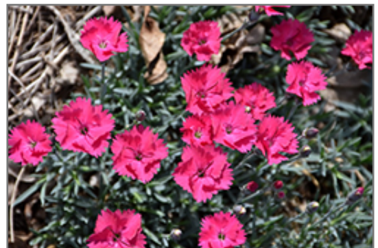
Paint The Town Magenta Pinks flowers