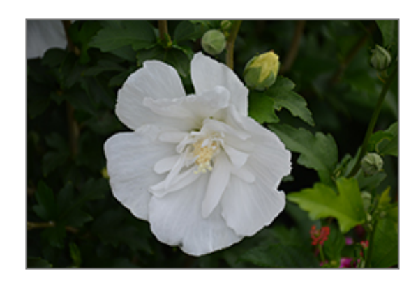
White Pillar Rose of Sharon flowers

White Pillar Rose of Sharon is a multi-stemmed deciduous shrub with a narrowly upright and columnar growth habit. Its average texture blends into the landscape, but can be balanced by one or two finer or coarser trees or shrubs for an effective composition.