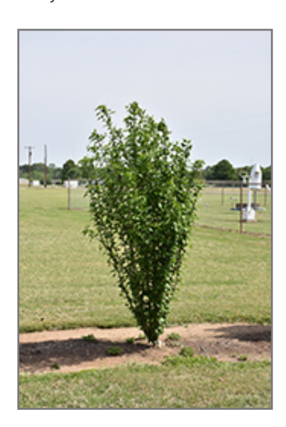
White Pillar Rose of Sharon