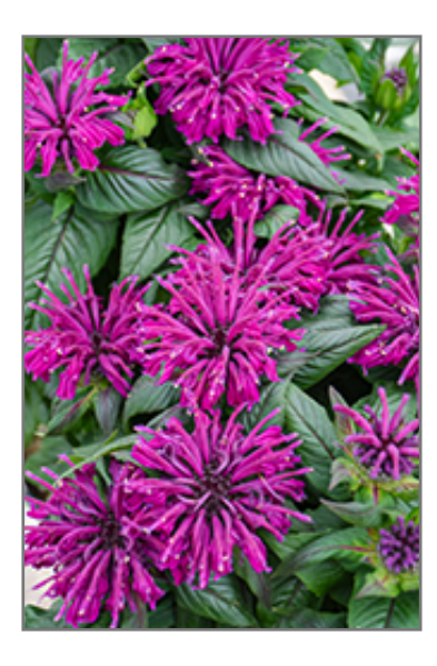
Rockin' Raspberry Beebalm flowers

This plant will require occasional maintenance and upkeep, and should be cut back in late fall in preparation for winter. It is a good choice for attracting bees, butterflies and hummingbirds to your yard, but is not particularly attractive to deer who tend to leave it alone in favor of tastier treats. Gardeners should be aware of the following characteristic(s) that may warrant special consideration;