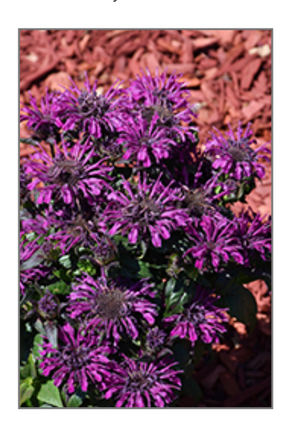
Rockin' Raspberry Beebalm flowers