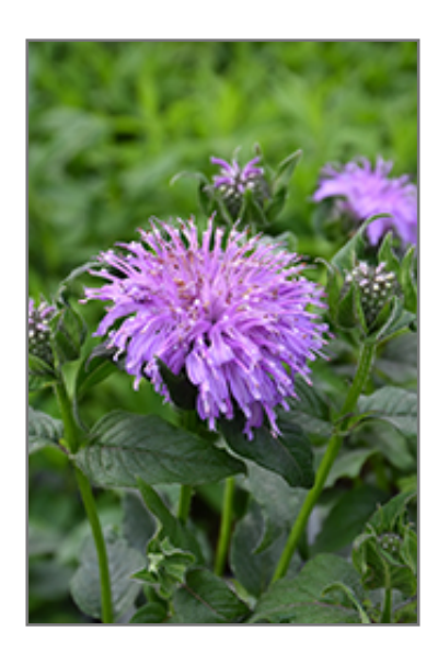
Blue Moon Beebalm flowers

This plant will require occasional maintenance and upkeep, and should be cut back in late fall in preparation for winter. It is a good choice for attracting bees, butterflies and hummingbirds to your yard, but is not particularly attractive to deer who tend to leave it alone in favor of tastier treats. Gardeners should be aware of the following characteristic(s) that may warrant special consideration;