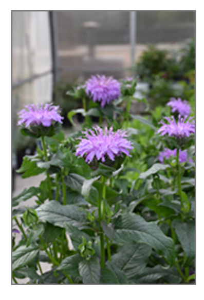
Blue Moon Beebalm flowers