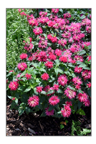
Balmy Rose Beebalm in bloom

This plant will require occasional maintenance and upkeep, and should be cut back in late fall in preparation for winter. It is a good choice for attracting bees, butterflies and hummingbirds to your yard, but is not particularly attractive to deer who tend to leave it alone in favor of tastier treats. Gardeners should be aware of the following characteristic(s) that may warrant special consideration;