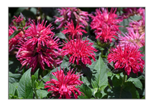
Balmy Rose Beebalm flowers

Balmy Rose Beebalm is an herbaceous perennial with a mounded form. Its medium texture blends into the garden, but can always be balanced by a couple of finer or coarser plants for an effective composition.