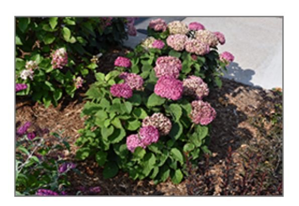
Invincibelle Mini Mauvette Hydrangea in bloom

This shrub will require occasional maintenance and upkeep, and is best pruned in late winter once the threat of extreme cold has passed. It has no significant negative characteristics.