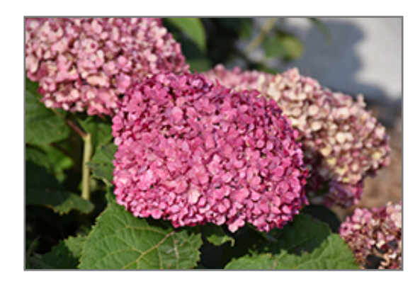
Invincibelle Mini Mauvette Hydrangea flowers

Invincibelle Mini Mauvette Hydrangea is a multi-stemmed deciduous shrub with a more or less rounded form. Its strikingly bold and coarse texture can be very effective in a balanced landscape composition.