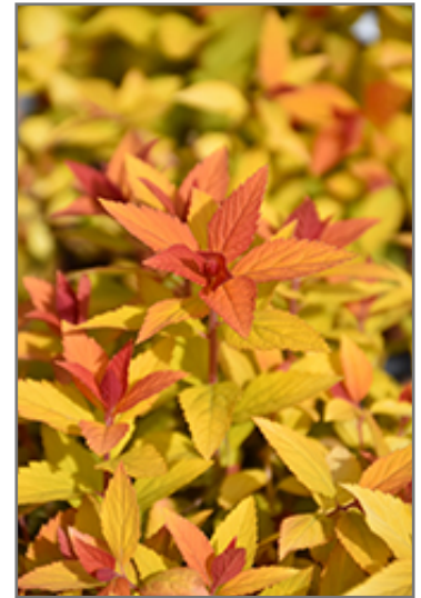
Double Play Candy Corn Spirea foliage

Double Play Candy Corn Spirea is recommended for the following landscape applications;