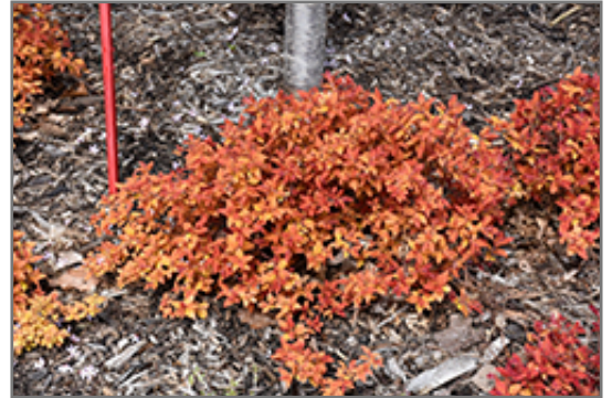
Double Play Candy Corn Spirea

This shrub should only be grown in full sunlight. It prefers to grow in average to moist conditions, and shouldn't be allowed to dry out. It is not particular as to soil type or pH. It is highly tolerant of urban pollution and will even thrive in inner city environments. This is a selected variety of a species not originally from North America.