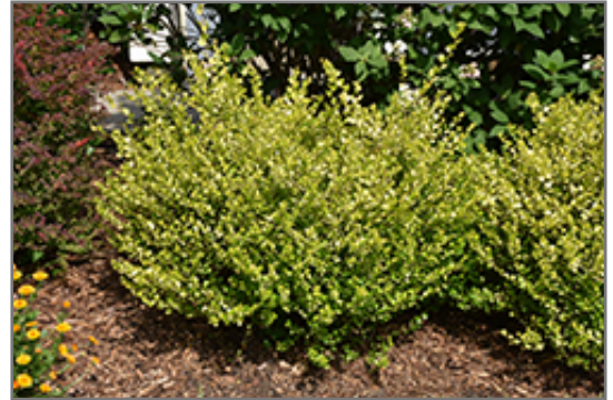
Cesky Gold Dwarf Birch