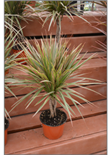
Colorama Dracaena in full

This is an herbaceous evergreen houseplant with an upright spreading habit of growth. Its relatively coarse texture stands it apart from other indoor plants with finer foliage. This plant may benefit from an occasional pruning to look its best.