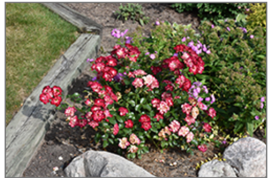
Never Alone Rose in bloom