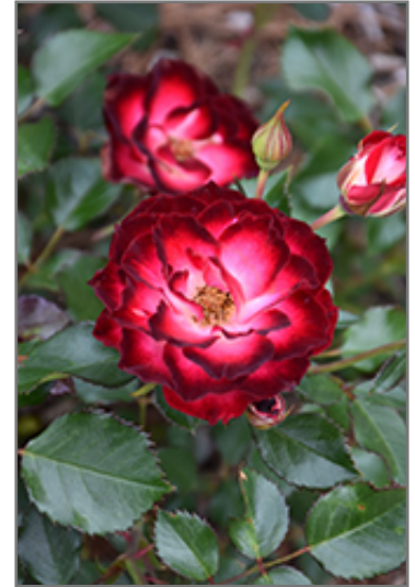
Never Alone Rose flowers