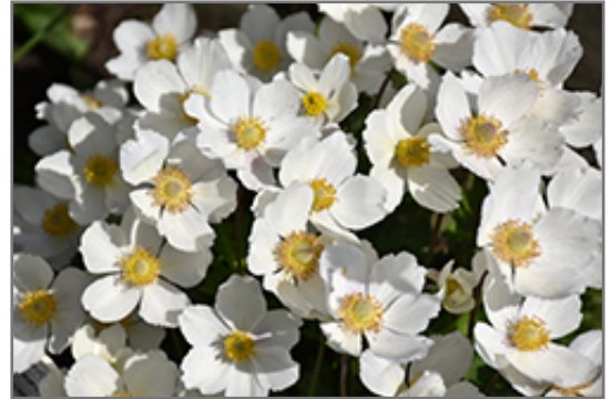
Windflower flowers