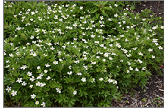
Windflower in bloom

Windflower will grow to be about 12 inches tall at maturity, with a spread of 18 inches. Its foliage tends to remain dense right to the ground, not requiring facer plants in front. It grows at a fast rate, and under ideal conditions can be expected to live for approximately 10 years. As an herbaceous perennial, this plant will usually die back to the crown each winter, and will regrow from the base each spring. Be careful not to disturb the crown in late winter when it may not be readily seen!