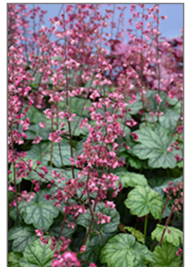
Berry Timeless Coral Bells flowers