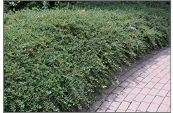
Coral Beauty Cotoneaster

This shrub will require occasional maintenance and upkeep, and should not require much pruning, except when necessary, such as to remove dieback. Deer don't particularly care for this plant and will usually leave it alone in favor of tastier treats. Gardeners should be aware of the following characteristic(s) that may warrant special consideration;