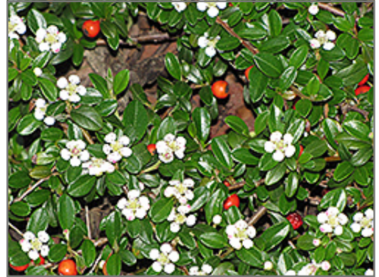
Coral Beauty Cotoneaster fruit

This plant is not reliably hardy in our region, and certain restrictions may apply; contact the store for more information.