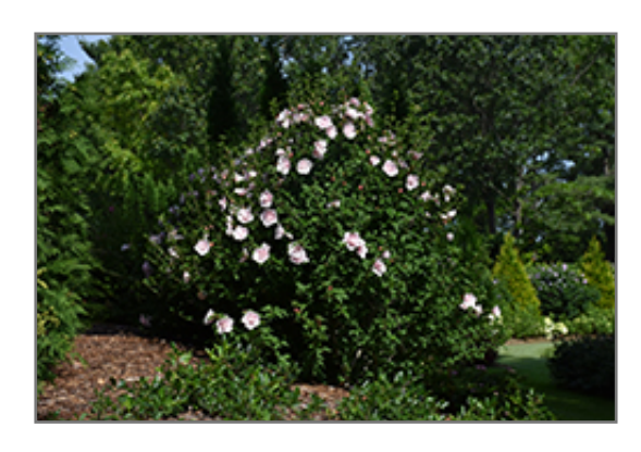
Pink Chiffon Rose of Sharon in bloom

This is a high maintenance shrub that will require regular care and upkeep, and is best pruned in late winter once the threat of extreme cold has passed. It is a good choice for attracting butterflies and hummingbirds to your yard, but is not particularly attractive to deer who tend to leave it alone in favor of tastier treats. Gardeners should be aware of the following characteristic(s) that may warrant special consideration: