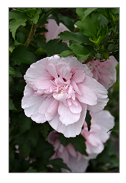
Pink Chiffon Rose of Sharon flowers

Pink Chiffon Rose of Sharon is a multi-stemmed deciduous shrub with an upright spreading habit of growth. Its average texture blends into the landscape, but can be balanced by one or two finer or coarser trees or shrubs for an effective composition.