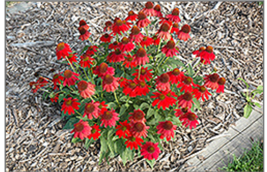
Sombrero Salsa Red Coneflower in bloom

Sombrero Salsa Red Coneflower is a fine choice for the garden, but it is also a good selection for planting in outdoor pots and containers. With its upright habit of growth, it is best suited for use as a 'thriller' in the 'spiller-thriller-filler' container combination; plant it near the center of the pot, surrounded by smaller plants and those that spill over the edges. Note that when growing plants in outdoor containers and baskets, they may require more frequent waterings than they would in the yard or garden. Be aware that in our climate, most plants cannot be expected to survive the winter if left in containers outdoors, and this plant is no exception. Contact our experts for more information on how to protect it over the winter months.