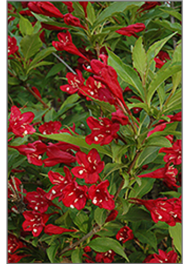
Red Prince Weigela flowers

Red Prince Weigela is recommended for the following landscape applications;