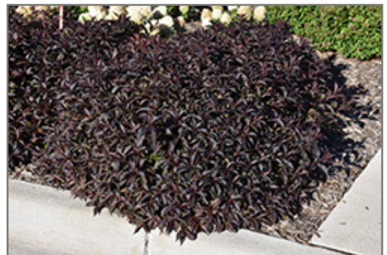
Spilled Wine Weigela