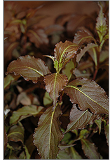
Spilled Wine Weigela foliage

Spilled Wine Weigela makes a fine choice for the outdoor landscape, but it is also well-suited for use in outdoor pots and containers. Because of its height, it is often used as a 'thriller' in the 'spiller-thriller-filler' container combination; plant it near the center of the pot, surrounded by smaller plants and those that spill over the edges. It is even sizeable enough that it can be grown alone in a suitable container. Note that when grown in a container, it may not perform exactly as indicated on the tag - this is to be expected. Also note that when growing plants in outdoor containers and baskets, they may require more frequent waterings than they would in the yard or garden. Be aware that in our climate, most plants cannot be expected to survive the winter if left in containers outdoors, and this plant is no exception. Contact our experts for more information on how to protect it over the winter months.