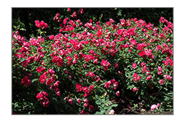
George Vancouver Rose in bloom

This is a high maintenance shrub that will require regular care and upkeep, and is best pruned in late winter once the threat of extreme cold has passed. Gardeners should be aware of the following characteristic(s) that may warrant special consideration;