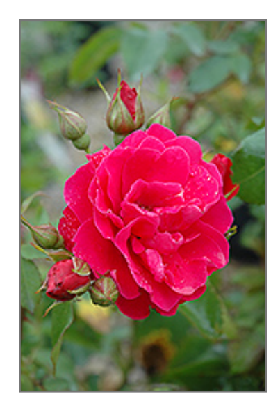
George Vancouver Rose flowers

George Vancouver Rose is a multi-stemmed deciduous shrub with an upright spreading habit of growth. Its average texture blends into the landscape, but can be balanced by one or two finer or coarser trees or shrubs for an effective composition.