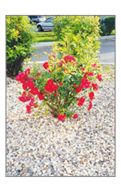
Alexander Mackenzie Rose in bloom

Alexander Mackenzie Rose is recommended for the following landscape applications;