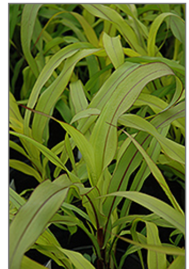
Jester Millet foliage