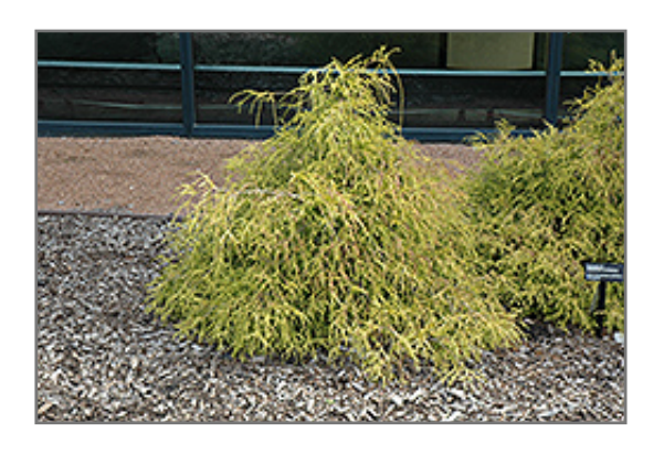
Sungold Falsecypress

Sungold Falsecypress is recommended for the following landscape applications;