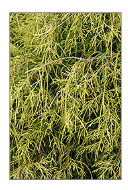
Sungold Falsecypress foliage

This is a relatively low maintenance shrub. When pruning is necessary, it is recommended to only trim back the new growth of the current season, other than to remove any dieback. It has no significant negative characteristics.