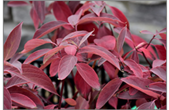
Arctic Fire Red Twig Dogwood in fall

This shrub does best in full sun to partial shade. It is an amazingly adaptable plant, tolerating both dry conditions and even some standing water. It is not particular as to soil type or pH. It is highly tolerant of urban pollution and will even thrive in inner city environments. This is a selection of a native North American species.