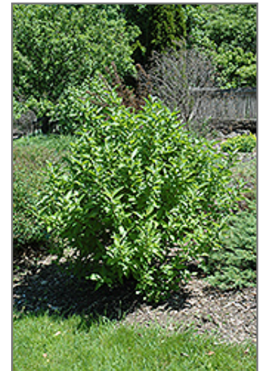
Arctic Fire Red Twig Dogwood