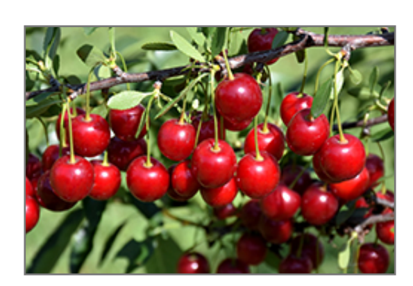
Crimson Passion Cherry fruit

A cross between the tart cherry and the Mongolian cherry produces a fruit with a high sugar content which makes for excellent fresh eating; the fruit is large and dark red in color