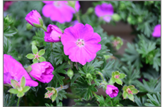
Max Frei Cranesbill flowers