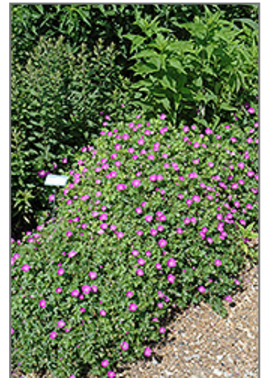
Max Frei Cranesbill in bloom