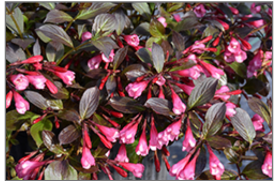
Very Fine Wine Weigela flowers

Very Fine Wine Weigela is recommended for the following landscape applications;