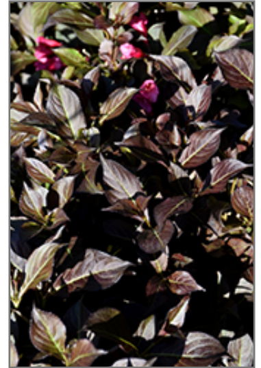
Midnight Wine Shine Weigela foliage