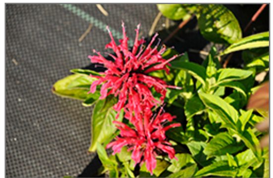
BeeMine Red Beebalm flowers