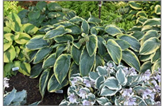
Shadowland Wu-La-La Hosta

Shadowland Wu-La-La Hosta is a dense herbaceous perennial with a mounded form. Its medium texture blends into the garden, but can always be balanced by a couple of finer or coarser plants for an effective composition.