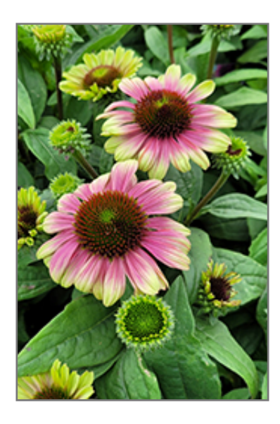
Sweet Sandia Coneflower flowers

Sweet Sandia Coneflower is recommended for the following landscape applications;