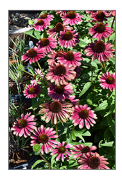
Sweet Sandia Coneflower flowers