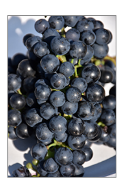
Baco Noir Grape fruit