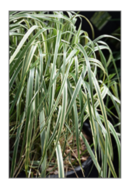
Hello Spring! Reed Grass foliage