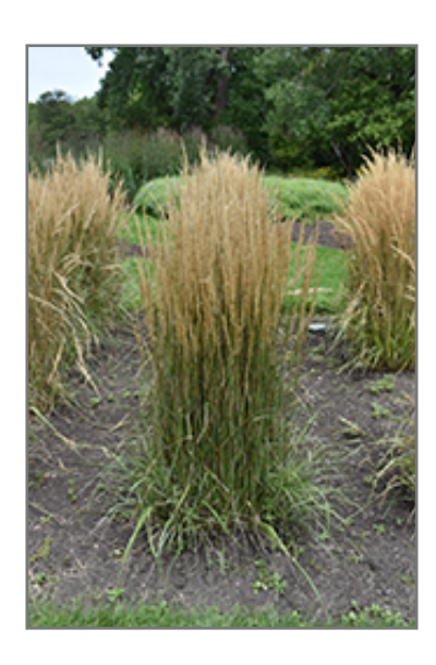
Hello Spring! Reed Grass in bloom

Hello Spring! Reed Grass is recommended for the following landscape applications;