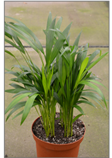
Areca Palm in full

This is a multi-stemmed evergreen houseplant with an upright spreading habit of growth. Its relatively fine texture sets it apart from other indoor plants with less refined foliage. This plant should not require much pruning, except when necessary to keep it looking its best.