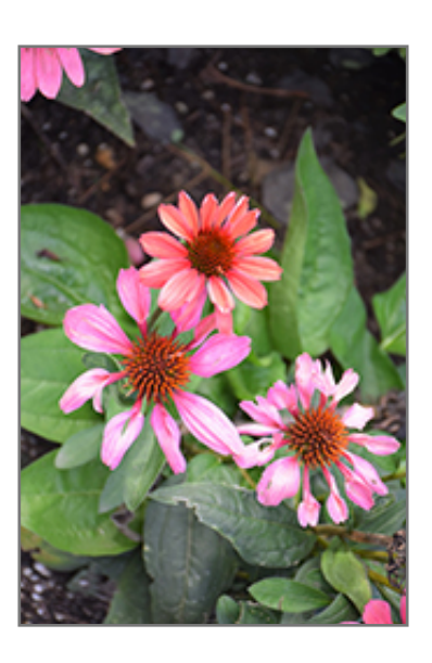
Eye-Catcher Coral Craze Coneflower flowers

Eye-catching, vibrant coral petals with red-orange center cone; fragrant flowers; great for flower arrangements, attracts pollinators and feeds the birds in winter; use in naturalized areas or along borders