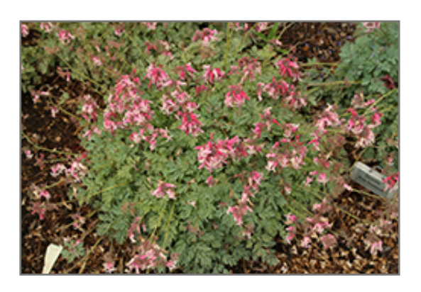
Pink Diamonds Fern-leaved Bleeding Heart in bloom

This plant will require occasional maintenance and upkeep, and should be cut back in late fall in preparation for winter. It is a good choice for attracting butterflies to your yard, but is not particularly attractive to deer who tend to leave it alone in favor of tastier treats. It has no significant negative characteristics.