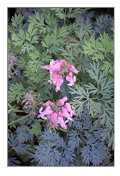
Pink Diamonds Fern-leaved Bleeding Heart flowers

Pink Diamonds Fern-leaved Bleeding Heart is an herbaceous perennial with a mounded form. It brings an extremely fine and delicate texture to the garden composition and should be used to full effect.