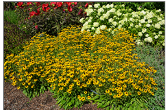
American Gold Rush Coneflower in bloom