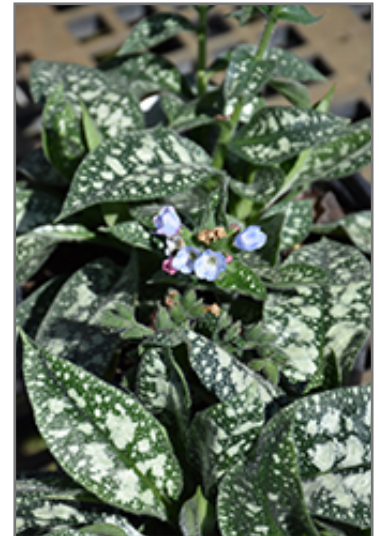
Twinkle Toes Lungwort flowers

Twinkle Toes Lungwort is recommended for the following landscape applications;