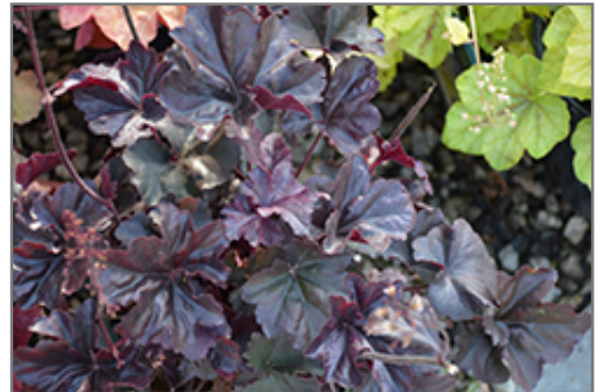
Obsidian Coral Bells foliage

Obsidian Coral Bells is recommended for the following landscape applications;