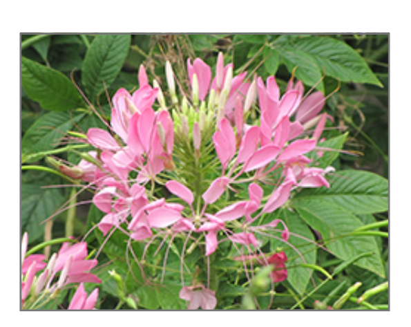
Sparkler Lavender Spiderflower flowers

This variety is a fast growing annual that typically may rise to four feet on rigid stems; dense terminal racemes of fragrant, lavender pink spider-like flowers from early summer until frost; tolerates light shade