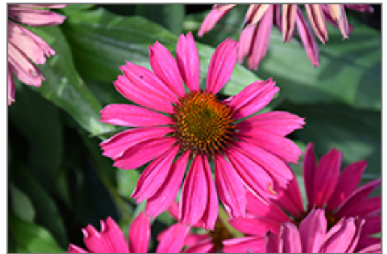
Kismet Raspberry Coneflower flowers