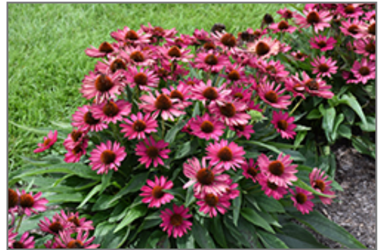
Kismet Raspberry Coneflower in bloom

Kismet Raspberry Coneflower will grow to be about 16 inches tall at maturity, with a spread of 24 inches. Its foliage tends to remain dense right to the ground, not requiring facer plants in front. It grows at a fast rate, and under ideal conditions can be expected to live for approximately 10 years. As an herbaceous perennial, this plant will usually die back to the crown each winter, and will regrow from the base each spring. Be careful not to disturb the crown in late winter when it may not be readily seen!