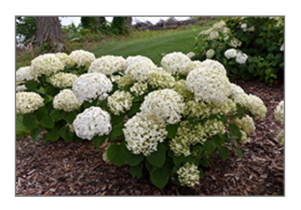
Invincibelle Wee White Hydrangea in bloom

Invincibelle Wee White Hydrangea is recommended for the following landscape applications;