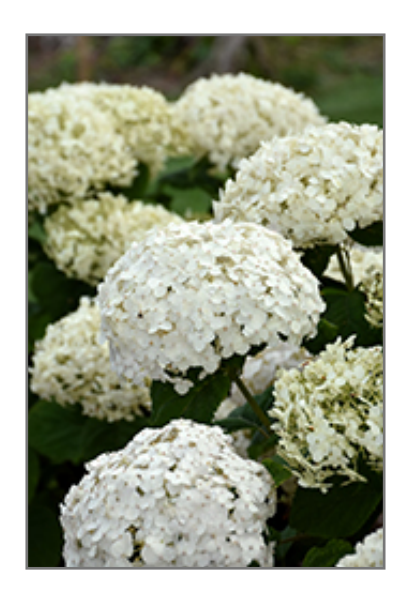
Invincibelle Wee White Hydrangea flowers

This shrub will require occasional maintenance and upkeep, and is best pruned in late winter once the threat of extreme cold has passed. It has no significant negative characteristics.